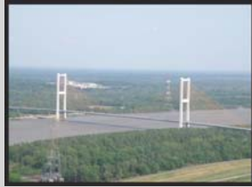
John James Audubon Bridge