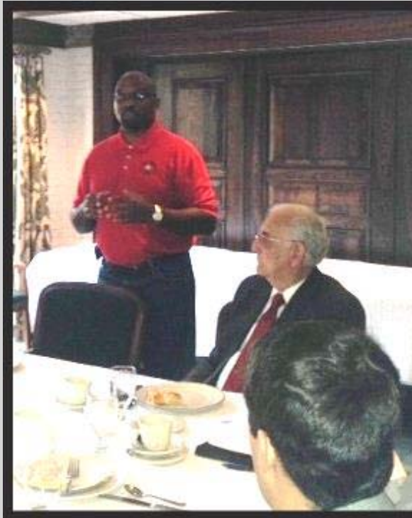
State Senator Troy Brown, one of the newer members of the Senate Transportation Committee, addressed the Good Roads' Board of Directors in November.