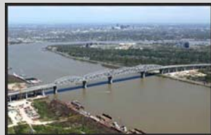
HPL Bridge was expanded to 3 wider lanes in each direction

Overall, TIMED is a Louisiana success story. The program widened 536 miles of two-lane highways to four lanes across the state, it built a new Mississippi River bridge linking West Feliciana and Pointe Coupee parishes, completely refurbished the Huey P. Long Bridge and made considerable improvements to the Port of New Orleans and the Louis Armstrong International Airport. Although two of the 16 projects remain incomplete (La. 3241 is review by the U.S. Army Corps of Engineers, and the Florida Avenue Bridge project is being re-evaluated in light of Hurricane Katrina's impact), TIMED put thousands of people to work, contributed billions of dollars to the state and local