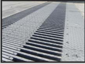
JJA's expansion joints allow 2 feet of expansion.

knew the accelerated TIMED program would need additional management oversight, but now he was leading an agency that wasn't enamored with the idea of bringing in an outside